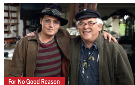
For No Good Reason

Simon Crowe's SC Films adds another impres-