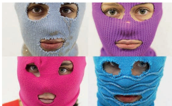
Pussy Riot — A Punk Prayer

Michael Fassbender, Maggie Gyllenhaal and Scoot McNairy, is currently shooting in Ireland.