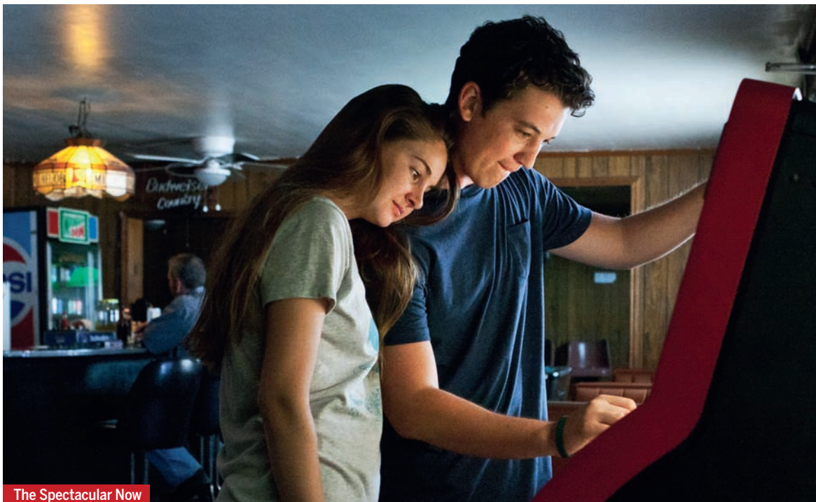
The Spectacular Now