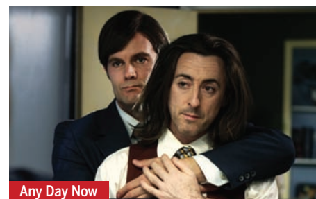
Any Day Now