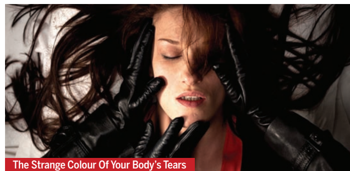
The Strange Colour Of Your Body's Tears