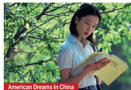
American Dreams In China

Hong Kong-based Golden Network Asia will also be in Berlin with Xu Zheng's comedy Lost In Thailand — a $5m mainland Chinese production that has recently grossed $200m in its home country. The film will be hitting US theatres through AMC Entertainment on February 8. Golden Network is also selling Xu Haofeng's Judge Archer and animated feature The Adventures Of Jinbao .