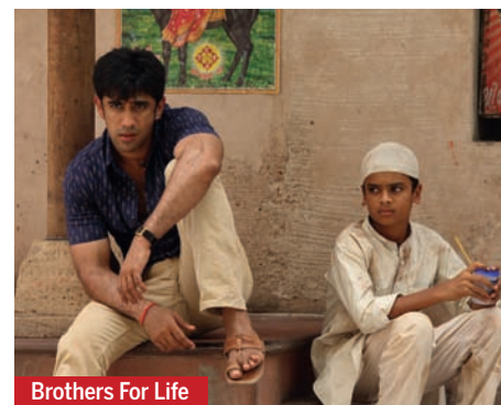
Brothers For Life