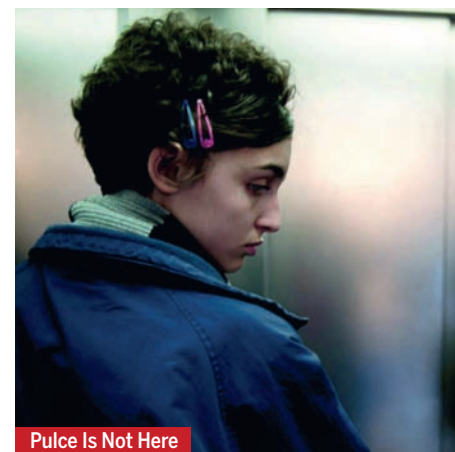
Pulce Is Not Here