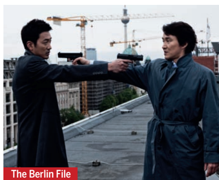
The Berlin File

to escape their mid-life crisis, who encounter a neglected child.