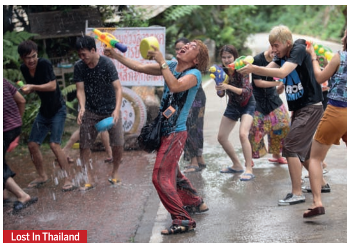
Lost In Thailand

Shochiku's new titles include Yuya Ishii's Fune Wo Amu , based on Shion Miura's best-selling novel, and Keiichi Hara's Keisuke Kinoshita Story , delving into lesser known aspects of the life of one of the masters of Japanese cinema. Toei will be introducing Izuru Narushima's A Chair On The Plains about three travellers, attempting