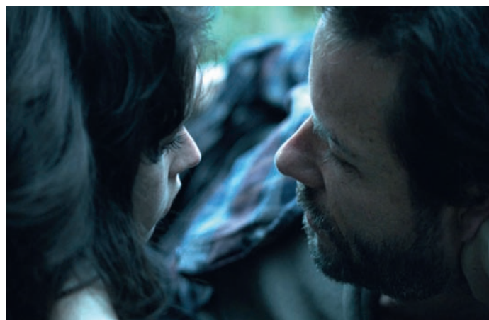
Breathe In, starring Guy Pearce and Felicity Jones

The Weinstein Company will talk up the Sundance grand jury and audience award winner Fruitvale . Ryan Coogler's true story charts the last day in the life of a Bay Area resident.