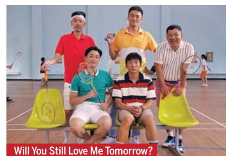
Will You Still Love Me Tomorrow?