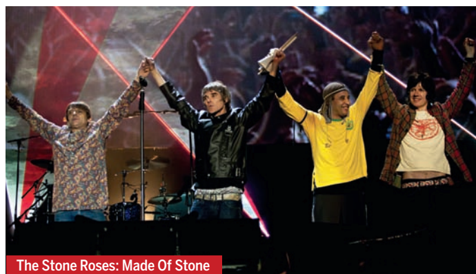
The Stone Roses: Made Of Stone