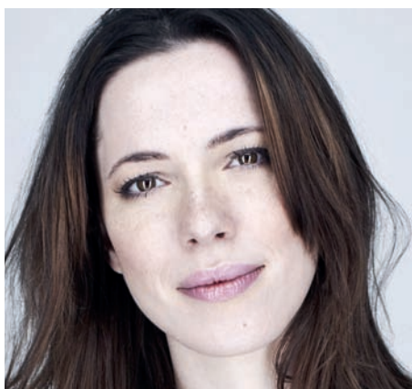
(Second row from left) Rebecca Hall, Meg Ryan, Radha Mitchell