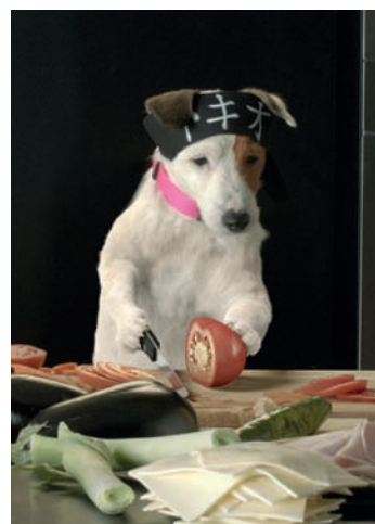
(Above, clockwise) Marshland, Millionaire Dog, 1864