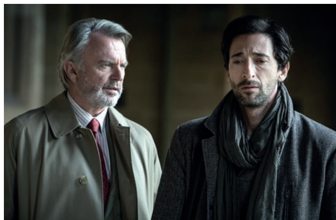
(Top) The Babadook ; (above) Backtrack

Benedict Cumberbatch is due to star in Sergei Bodrov's drama Blood Mountain , which Altitude will be selling. The film follows a private contractor who must escort one of the world's most wanted