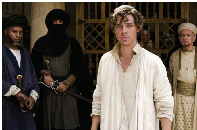
(Top) Los Angeles ; (above) The Physician ;