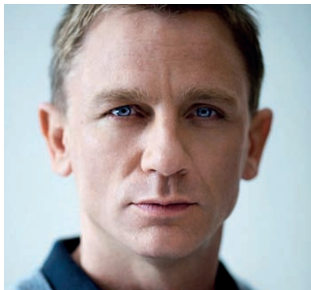
(Top row from left) Richard Gere, Daniel Craig, Bruce Willis