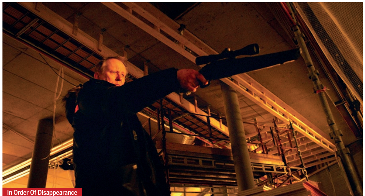
In Order Of Disappearance