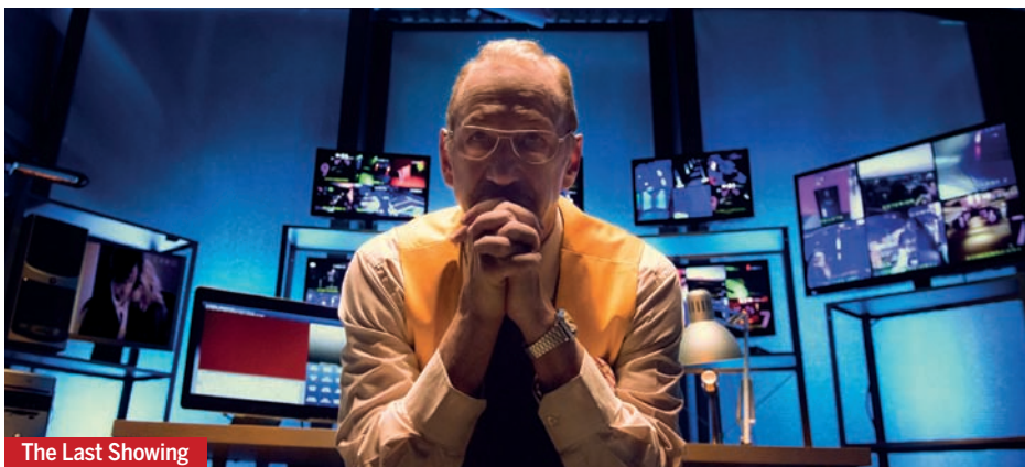
The Last Showing

Fledgling outfit Saradan will make its market debut with Russian action-thriller Viktor , starring Gerard Depardieu and Liz Hurley.