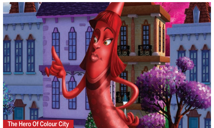
The Hero Of Colour City