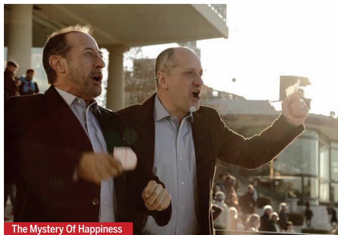
The Mystery Of Happiness

produce with Ireland-based Subotica. Production is scheduled to begin in Dublin in late March.