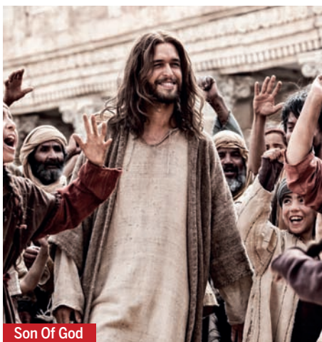
Son Of God