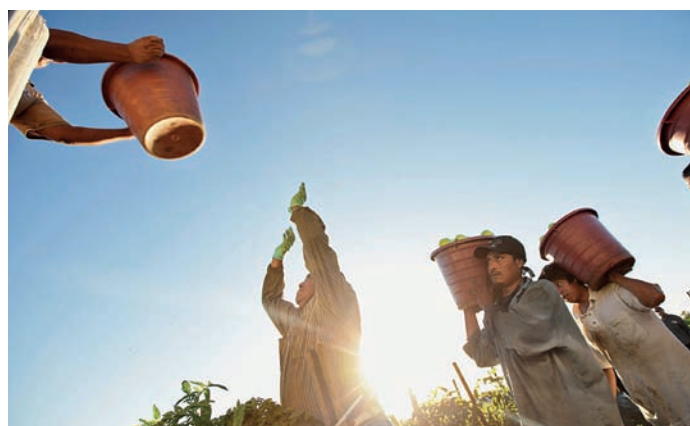
(Above) Food Chains

Electric Entertainment has picked up international rights to John Slattery's feature directorial debut and Sundance premiere, God's Pocket , starring the late Philip Seymour Hoffman. IFC holds US rights to the story of a construction site death