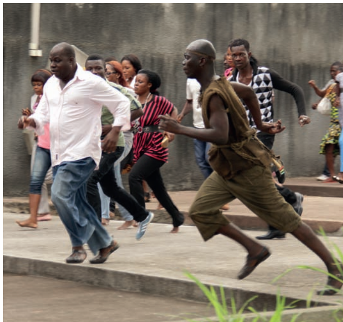
(Above) Run ; (above right) The Kidnapping Of Michel Houellebecq