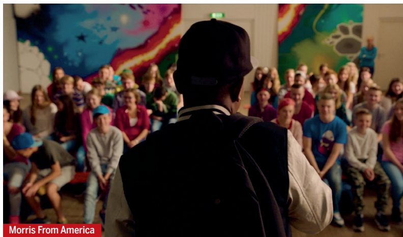
Morris From America