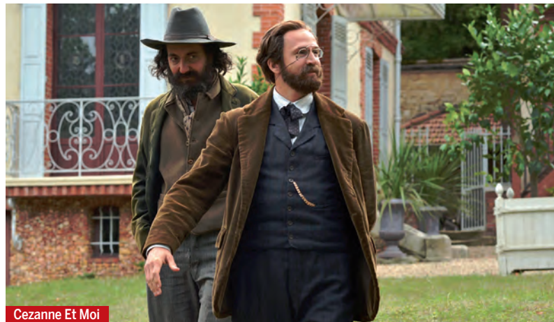
Cezanne Et Moi