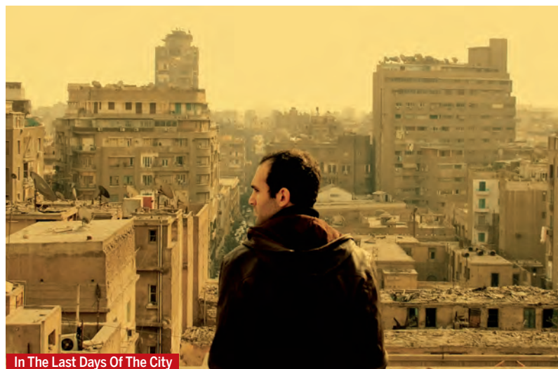
In The Last Days Of The City

drama The Black Frost (Panorama) and In The Last Days Of The City , which is about a film-maker trying to record his home city of Cairo in the lead-up to the 2011 revolution.