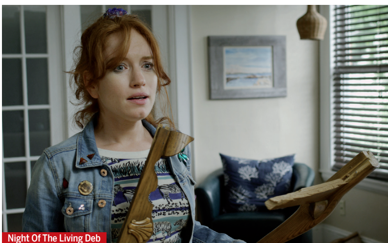
Night Of The Living Deb