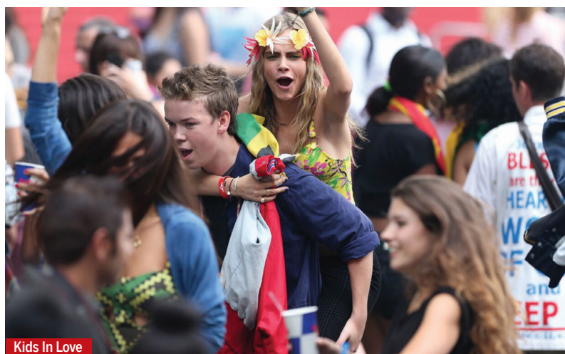
Kids In Love