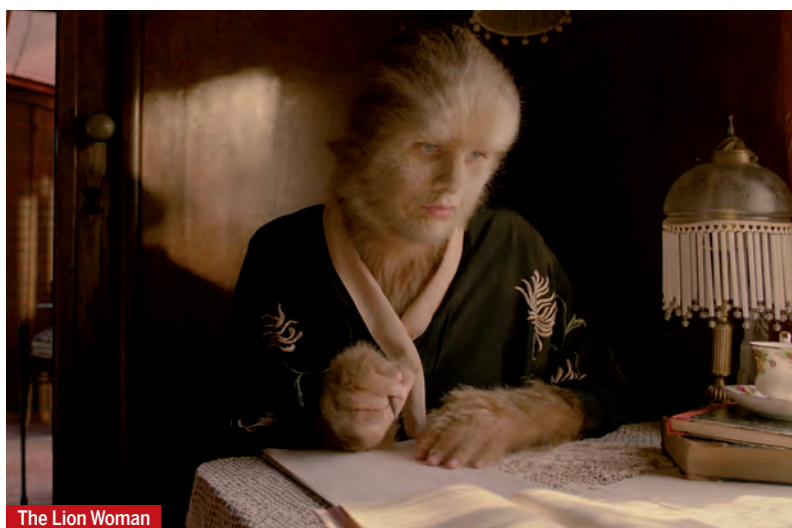
The Lion Woman