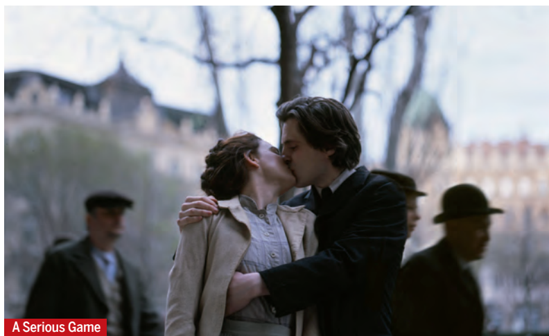
A Serious Game