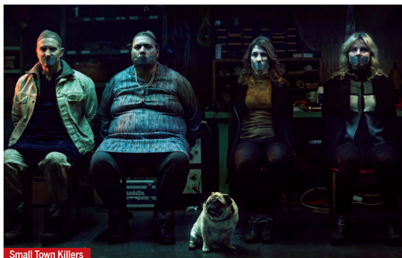
Small Town Killers