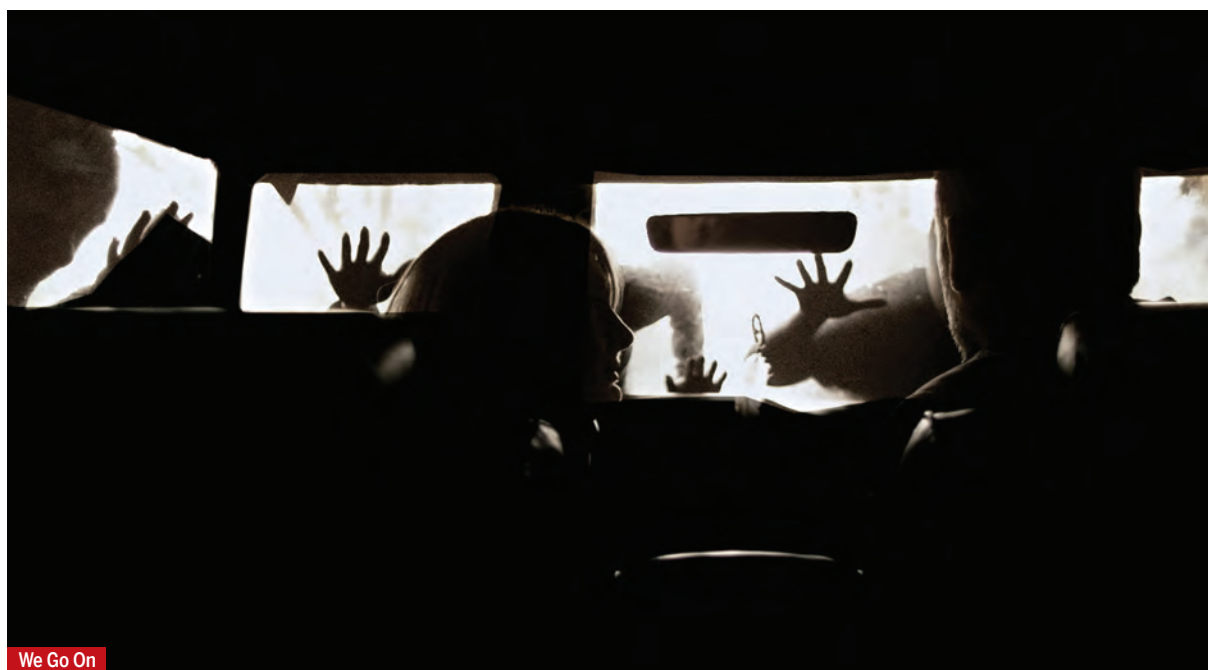
We Go On

The Trip , which sees the comedians take their gentle bickering, ruminations on life and endless impersonations to Spain.