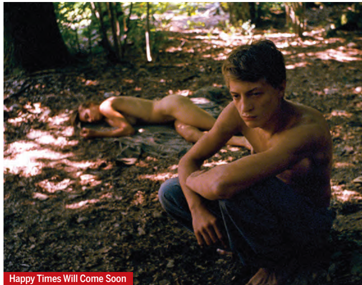
Happy Times Will Come Soon