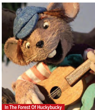
In The Forest Of Huckybucky