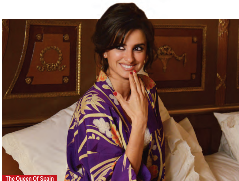
The Queen Of Spain

Spotlight Pictures is screening Bitter Harvest starring Max Irons, Samantha Barks, Barry Pepper and Terence Stamp. The romantic epic takes place against the backdrop of Stalin's genocide of the Ukrainian population in the early 1930s.