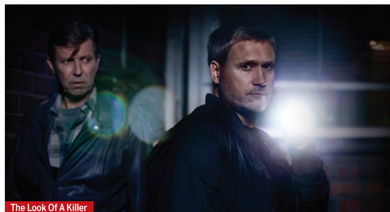
The Look Of A Killer