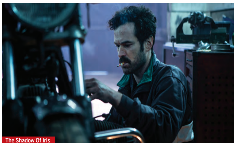
The Shadow Of Iris