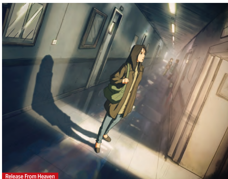
Release From Heaven