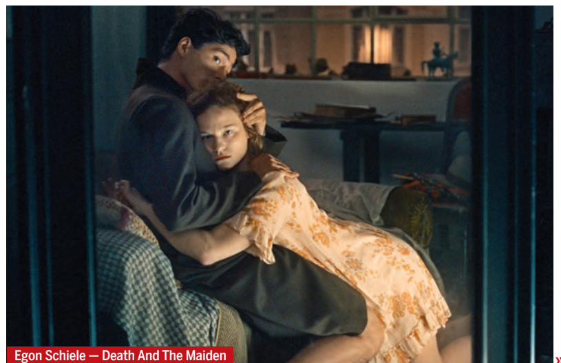
Egon Schiele — Death And The Maiden