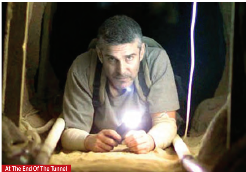
At The End Of The Tunnel

Intramovies is handling Miya Hatav's Between Worlds , an Israeli drama about two women who meet in a hospital, and The Missing Paper , an action drama inspired by a real-life DC9 air disaster.