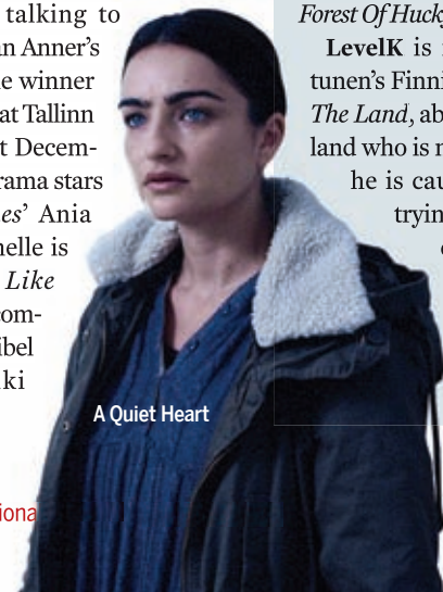
A Quiet Heart