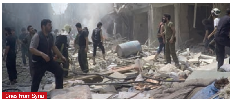
Cries From Syria

relationship between a singer and her protégé that won the audience award at Tallinn Black Nights Film Festival.