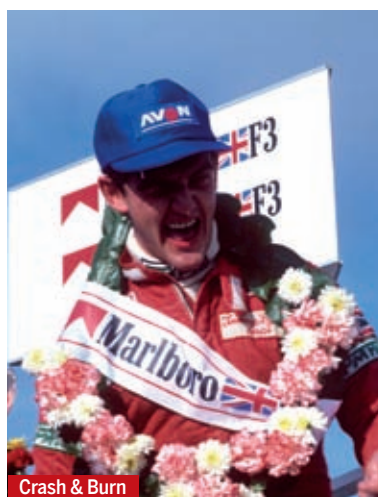
Crash & Burn