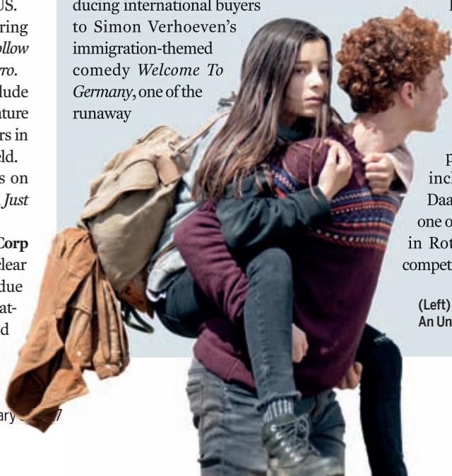
(Left) Mountain Miracle — An Unexpected Friendship