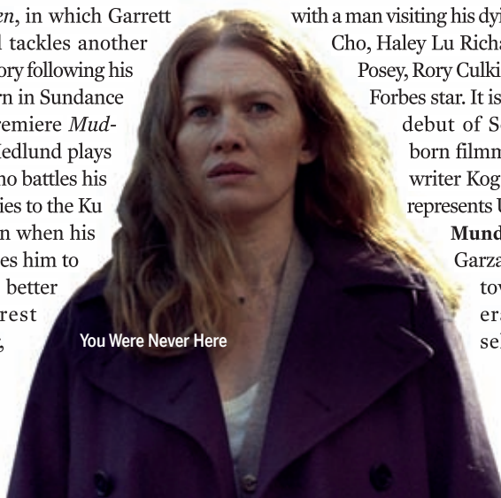
You Were Never Here