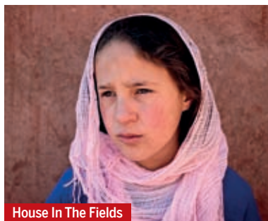
House In The Fields