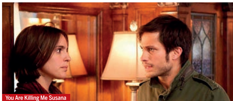
You Are Killing Me Susana