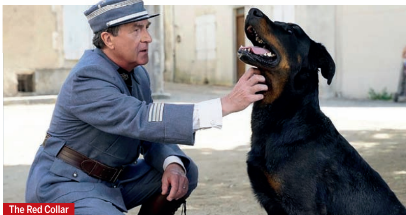
The Red Collar