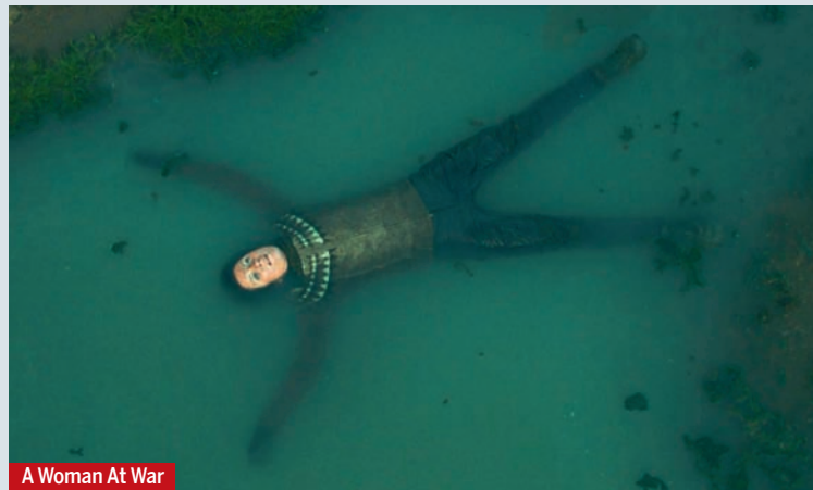
A Woman At War