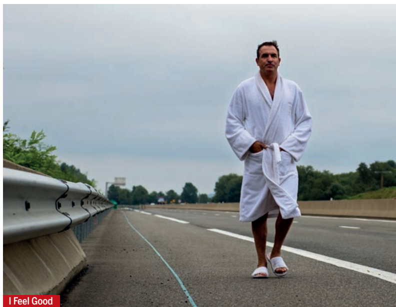
I Feel Good

Elle Driver launches Benoit Jacquot's Mr Casanova , starring Vincent Lindon as the Venetian adventurer opposite Stacy Martin and Valeria Golino, and Naomi Kawase's upcoming Japan-set feature Vision starring Juliette Binoche. It will also show first footage of Eva Husson's Girls Of The Sun , starring Golshifteh Farahani as a Kurdish female fighter.