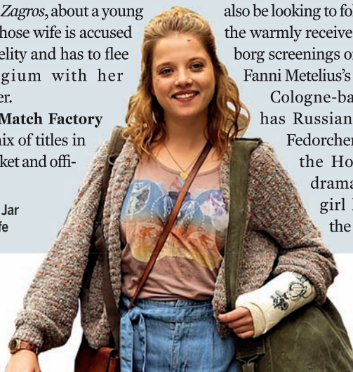
(Right) A Jar Full Of Life