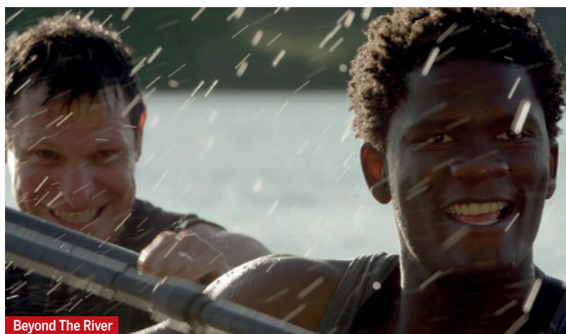
Beyond The River

dog's journey to domestication in the harsh environment of gold-rush Alaska.